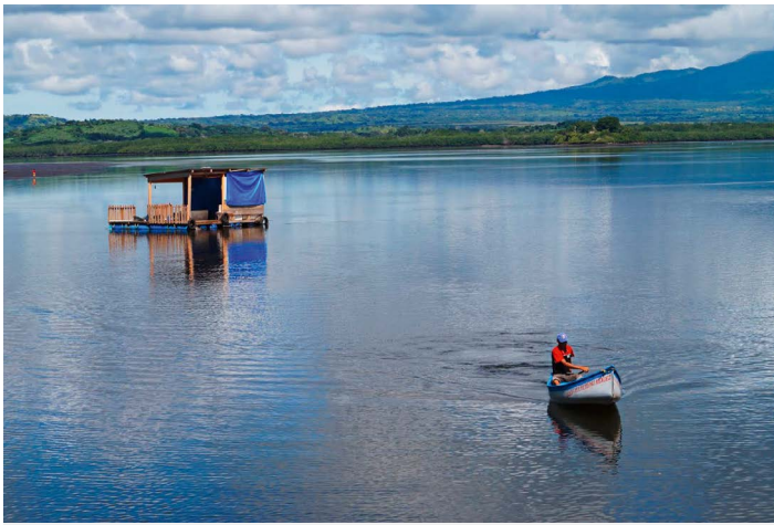
Sustainable fishing in Nicaragua, where the EU is supporting local fishing communities. Read the story on europa.eu/eyd/2015 .